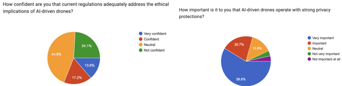
Fig. 2. Statistics of the answers

of the respondents stated that they are somewhat or very familiar with the concept of AI-based drone systems, respectively, making them a perfect fit for the purpose of the survey.